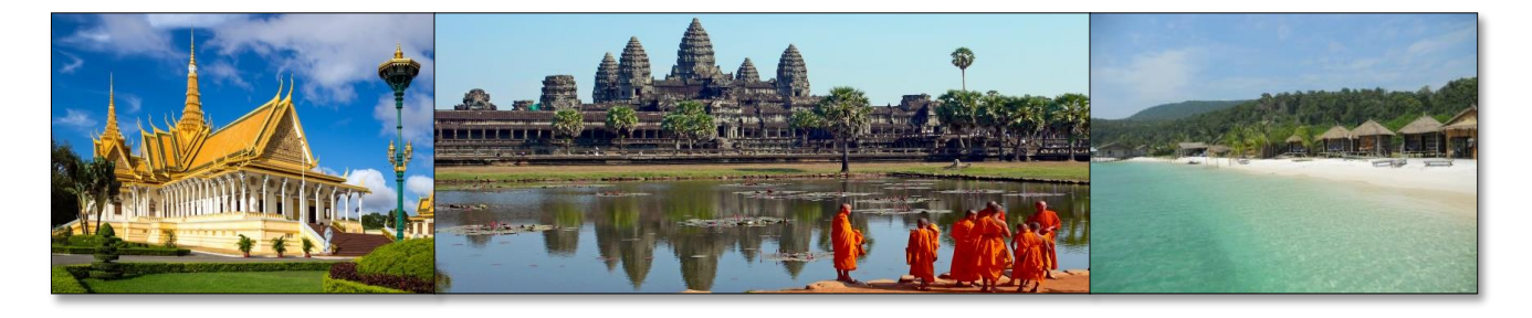
6 Days Siem Reap & Phnom Penh By Bus